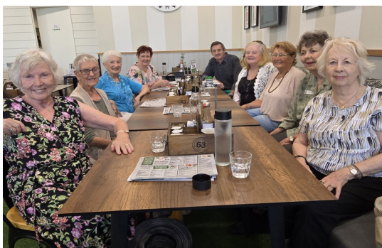
Playreading Group celebrating end of year at Café 63 Cleveland.