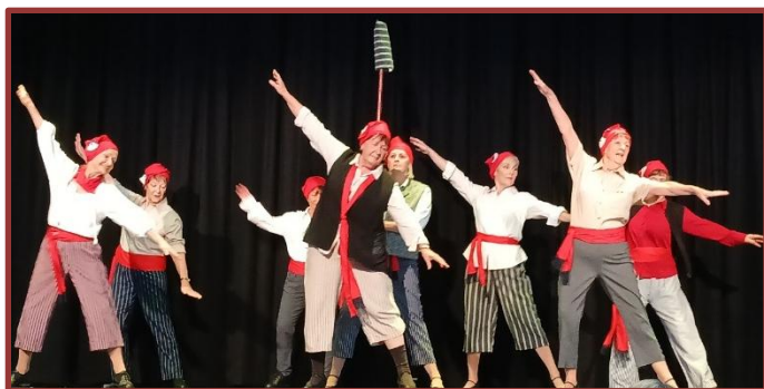
U3A Jazz & Tap performers

Congratulations to those three groups and their leaders.