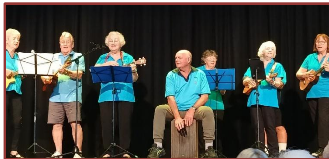
U3A Ukulele players (GRUBS)