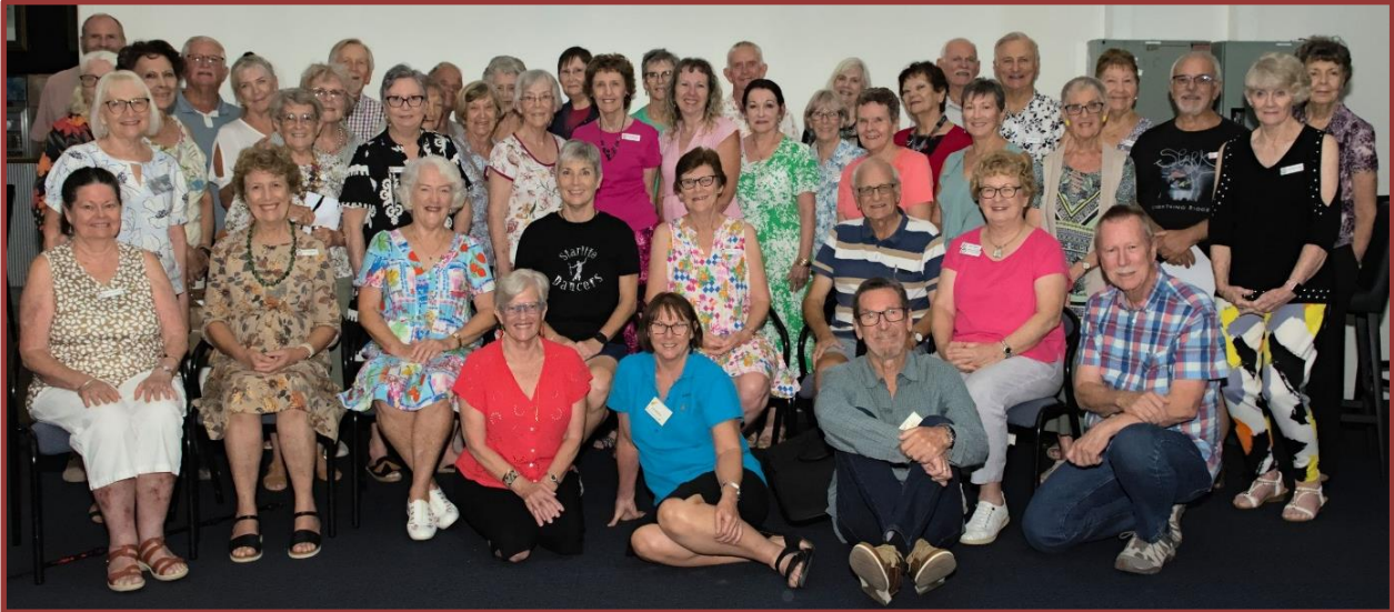
Tutors and Assistants

Some of the Classes on offer for 2025 iPhoneography, Japanese, Flower Arranging, Camera Club, History through the Ages, Wine for Fun, Book Discussion