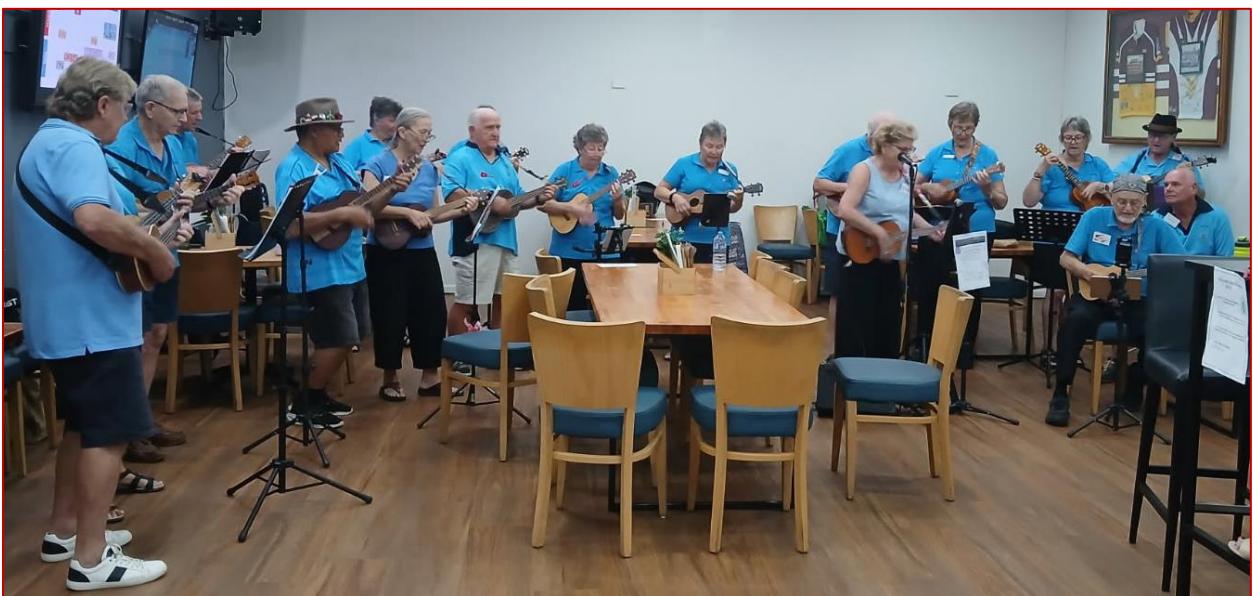
GRUBS entertained us at the Open Day