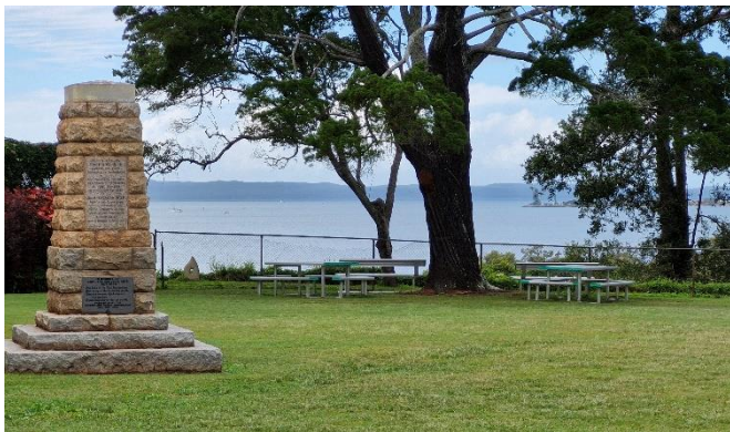
Bay view from Ormiston House property

This is an Ormiston House Event (not U3A) that we thought may be of interest. If you would like to join with other U3AR members and be part of a table booking. Please contact the U3A Office on 3821 3888 by 21 June so that we can make a booking.