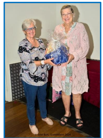
Another Raffle Winner