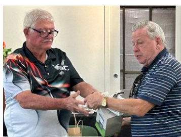
Third Charles De Wet