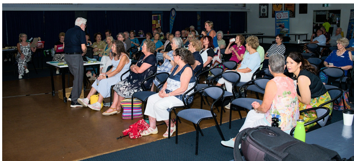
The Tutor Forum