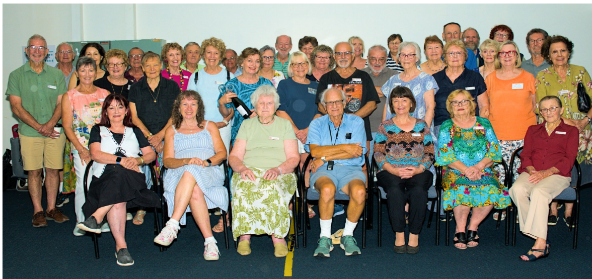
Tutors and Assistants