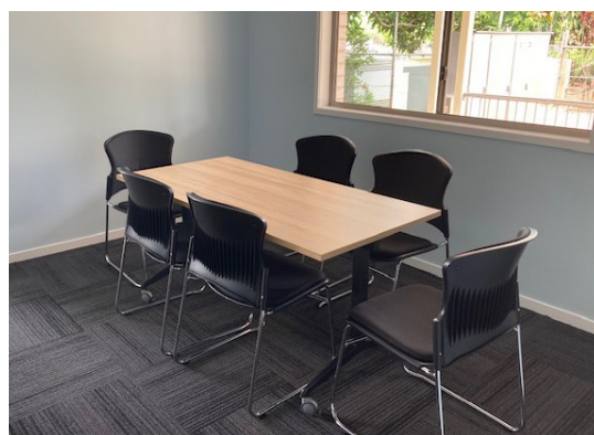
Small Meeting Room