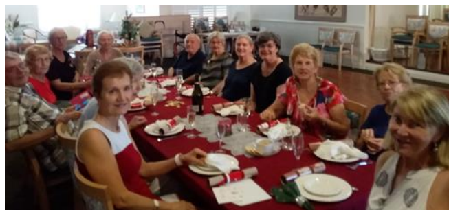
English Country Dance Group Christmas Party and Farewell