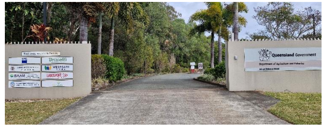
1. Enter from Delancey Street via main gate of the Research Station

PARKING ON SITE There is plenty of parking available on site: