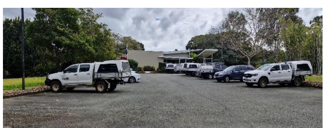
2. Turn right to meeting room Car Park