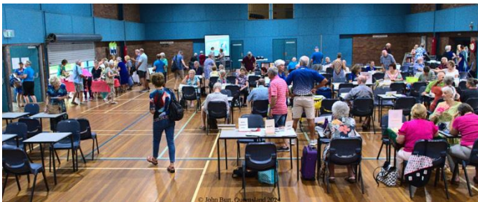
The venue had plenty of space and a great layout.