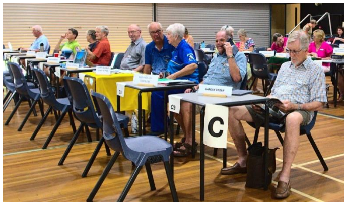
Tutors set up ready for first customers of the day.